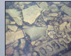
Beach off McMurty Dr (NE shore)