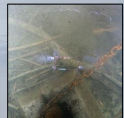
Park dock footing (N shore)

Recreational water users are reminded to Clean, Drain and Dry ALL equipment before it enters the lake, and after it leaves the lake!