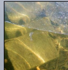
Cinder blocks off Sumac Ln (SW shore)