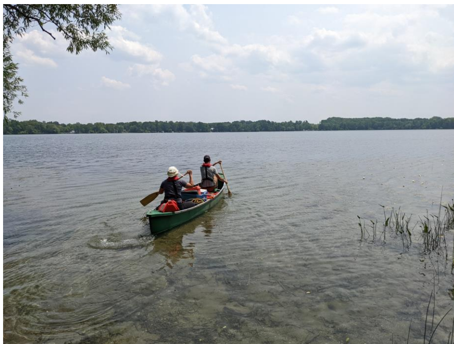
SSEA Staff on Little Lake Midland