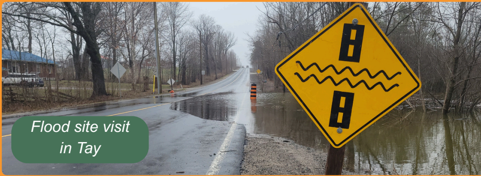
Flood site visit in Tay

Field visits were conducted throughout the watershed to document spring flooding .