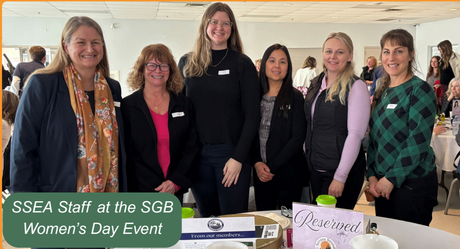
SSEA Staff at the SGB Women's Day Event

fulfilling SSEA duties as a Risk Management Official