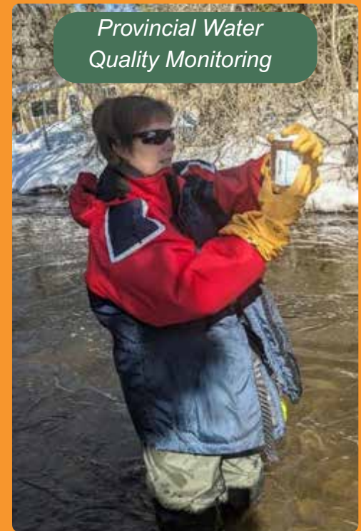
Provincial Water Quality Monitoring